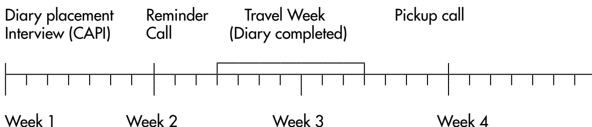
Figure 2.2 Possible calls made by an interviewer to household

In advance of the interviewer's first call, the respondent receives an advance letter explaining the purpose of the study and that an interviewer will call.